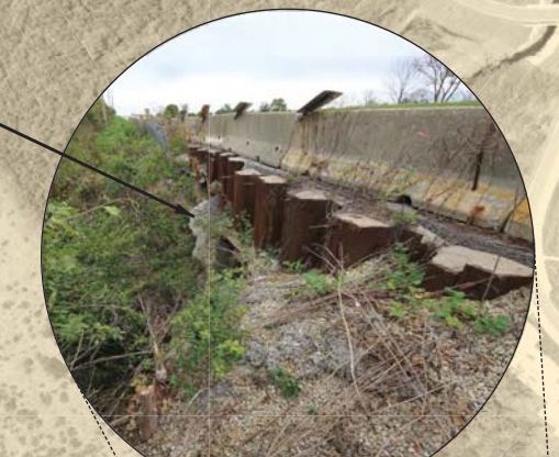
GRANT CREEK CULVERT