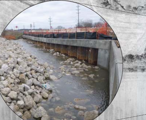
EROSION & DRAINAGE IMPROVEMENTS (INITIAL IMPROVEMENTS; ADDITIONAL IMPROVEMENTS AND EROSION REPAIR UNDER STUDY)